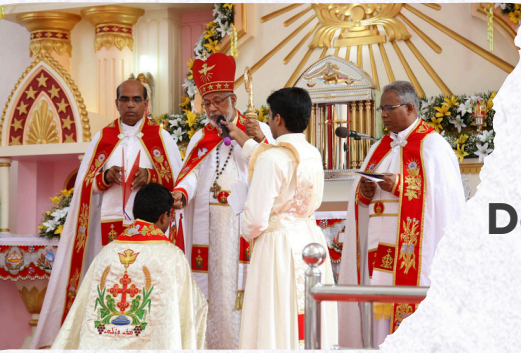
Minor Seminary 3 Years Deepti Seminary, Melampara