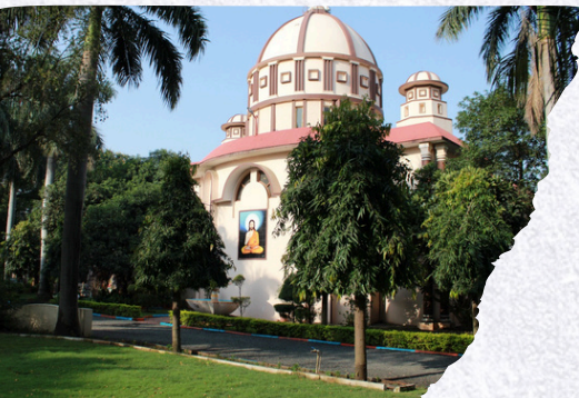
Philosophy 3 Years Ruhalaya Major Seminary Ujjain