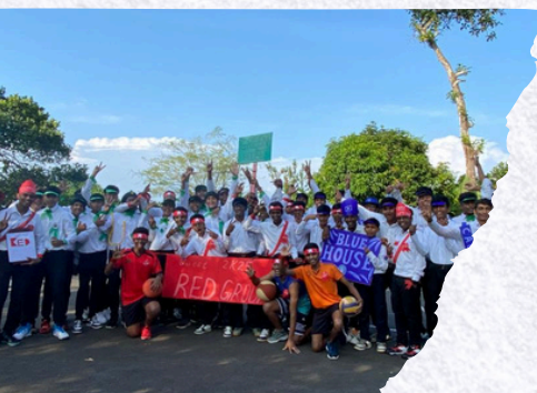
Regency 1 Year Expeirecne in the missions