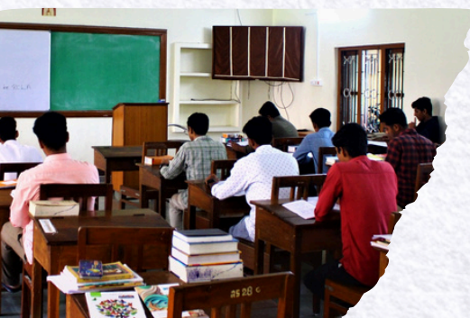
Theology 4 Years Ruhalaya Major Seminary Ujjain