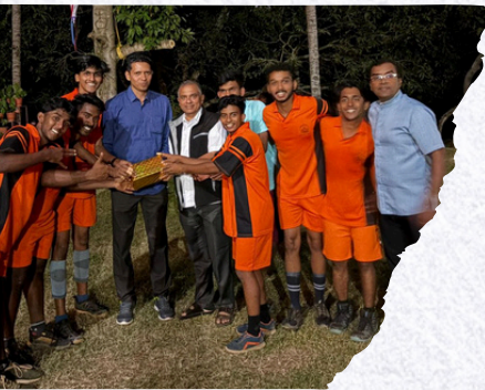
MOC: Mission Orientation Course 1 Year Jeevan Jyoti Srirangapatana