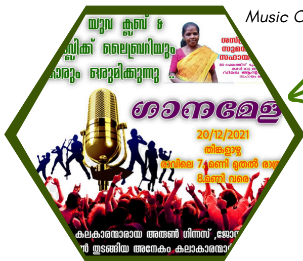
Music Concert Fundraiser