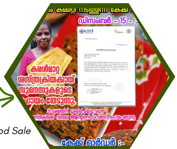
Donations from Food Sale

All income from this bus service was donated to Vimala