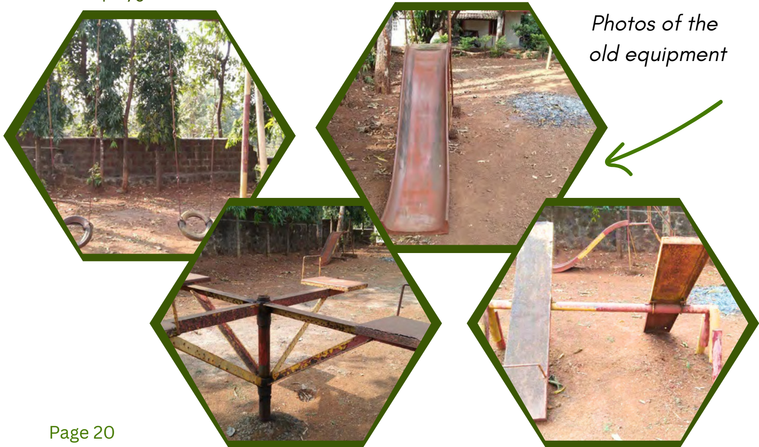
Photos of the old equipment