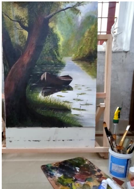
Paintings by Ratheesh