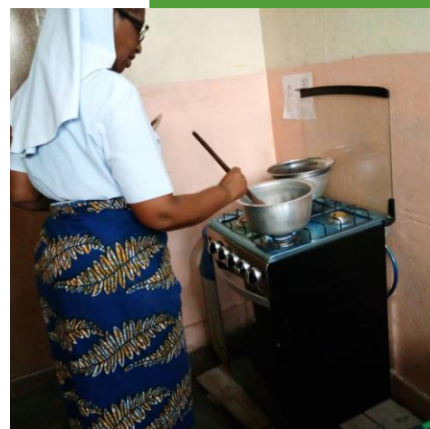
The new stove has been installed