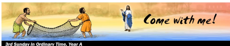
3rd Sunday in Ordinary Time, Year A

A MenALIVE Men's Weekend will be held at the St Joseph's Toronto Parish on the weekend of 25 and 26 March 2023 . The weekend is suitable for all men from 18 years of age and provides an opportunity for attendees to explore what makes them feel fully alive. More information including how to register will be provided closer to the date. For more information on MenALIVE, visit: www.menalive.org.au