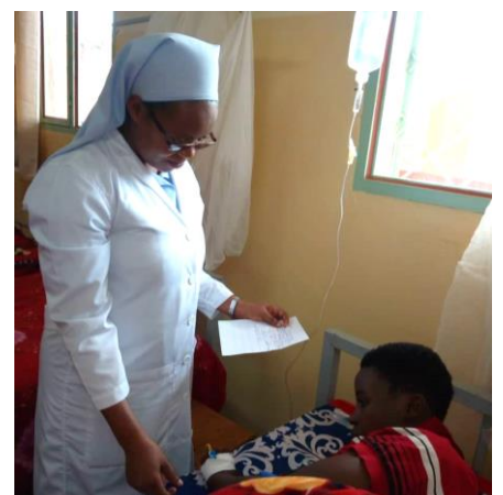
The Bene Mariya Sisters care for those who are ill.