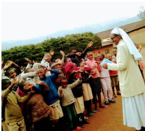
The Bene Mariya Sisters work with local schools

Each stove will cost $630, so for five stoves the total is $3150.00. The sisters can buy the gas in the city of Bujumbura and they estimate using 25kg per month at a total cost of $122.26/month.