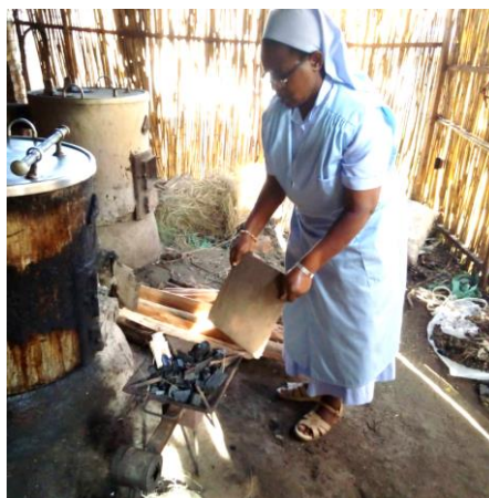
The stoves that the sisters are currently using with coal.