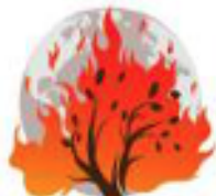
The Burning Bush

Children of Branxton Parish Sacramental Program are preparing to receive the Sacrament of Holy Communion for the first time next Saturday 24 September at 6pm Mass in Branxton. Please keep them in your prayers as they complete their final formation.