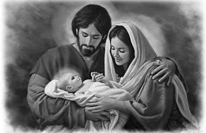
Artwork by Ratheesh Pushkkaran

The fruits of the first general assembly of the Fifth Plenary Council of Australia have been gathered in a new report that contains dozens of proposals to shape the ongoing Council journey. The published document reveals the directions of the small groups' discernment at the Plenary Council in October and offers them as a basis for the ongoing preparation for the second assembly. You can access the document at: https://bit.ly/FirstAssembly