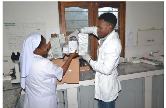
Opening the machine in the laboratory