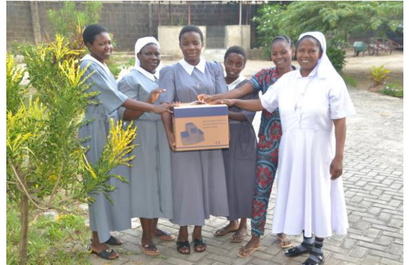
The Sisters receiving the machine

The staff have started using the equipment and are very grateful to the Parishes of Branxton and Singleton for their donation. Special mention to the Branxton Caritas group for their donation of $4000 to Hope Tree Group.