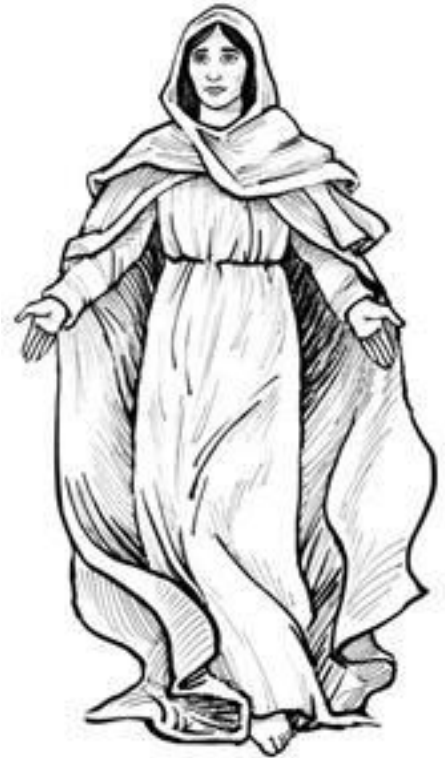
Mary was assumed into heaven. Colour the picture of Mary.

With all my heart I praise the Lord, and I am glad because of God my Saviour. He cares for me, his humble servant. All people will say God has blessed me. God All-Powerful has done great things for me, and his name is holy.